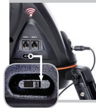
WiFi switch on right position

Start by pointing at distant terrestrial objects. Locate something with your StarPointer first, then look at the object using the 25mm eyepiece. Switch to the 10mm eyepiece, and notice how it increases the magnification and decreases the field of view. When you change eyepieces, you may have to readjust the focus slightly to get the sharpest image.