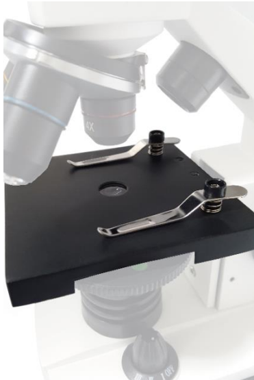
Fig. 6. The specimen stage.

1.2.4 The specimen stage. Place the specimens that you want to examine later on the specimen stage (7). This has two specimen spring clamps (8) that hold the respective specimen in place on the specimen stage. When you clamp the slides (8), they are held in position so that you can examine them manually under the lens. The specimen stage (7) itself is always in a specific position that can be adjusted using the two large black focus wheels (10) on the right and left of the Omegon VisioStar. You will see how the table rises and lowers when the wheels are turned.