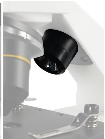
Fig. Incident light

The knob (13) on the left-hand side can dim the entire lighting steplessly. To gauge the dimming level, there is a scale of 1-8 for the steplessly set position.