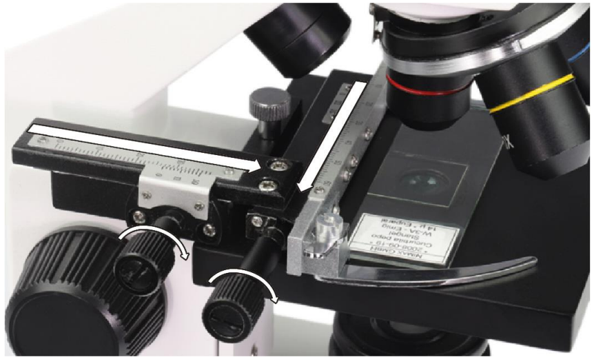
Fig. Use of the optional mechanical stage adapter (Art.No.62506)