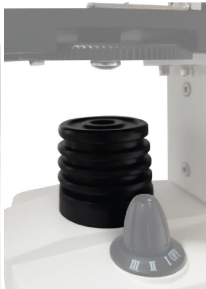
Fig. Transmitted light